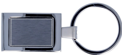
3. FRONT DO