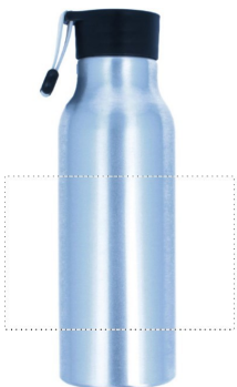
3. ROUND SCREEN