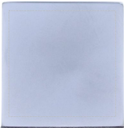
2. BASE BACK