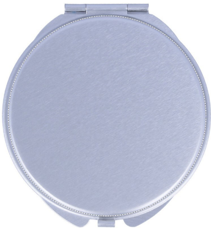
5. BOTTOM PD